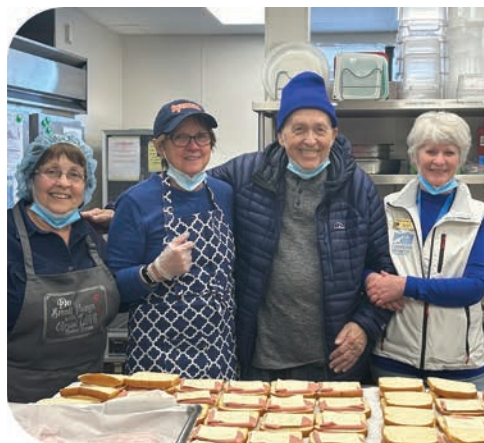
Holy Cross volunteers