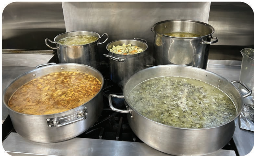
Nutritious meals prepared by volunteers