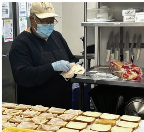
Saturday Volunteer Opportunities