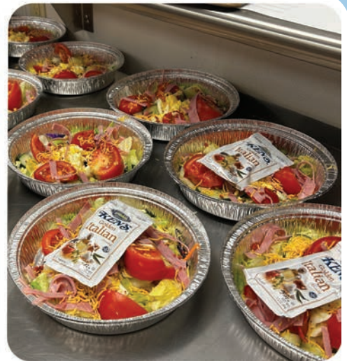
Fresh salads in season