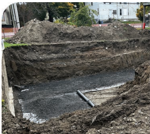
Excavation October / November 2023

able for our food pantry, children's supplies, books, and the ability to add a generator and walk-in cooler. We are opening for our guests in April 2024! Thank you to our benefactors, foundations, architects, contractors, board members, and loyal volunteers for their support and patience in bringing this vision to reality in God's name and His timing! It is a true testament of service.