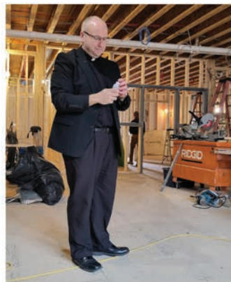
Blessing the space