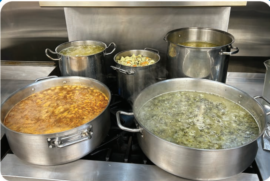
"Soup of the Day" Wednesdays!