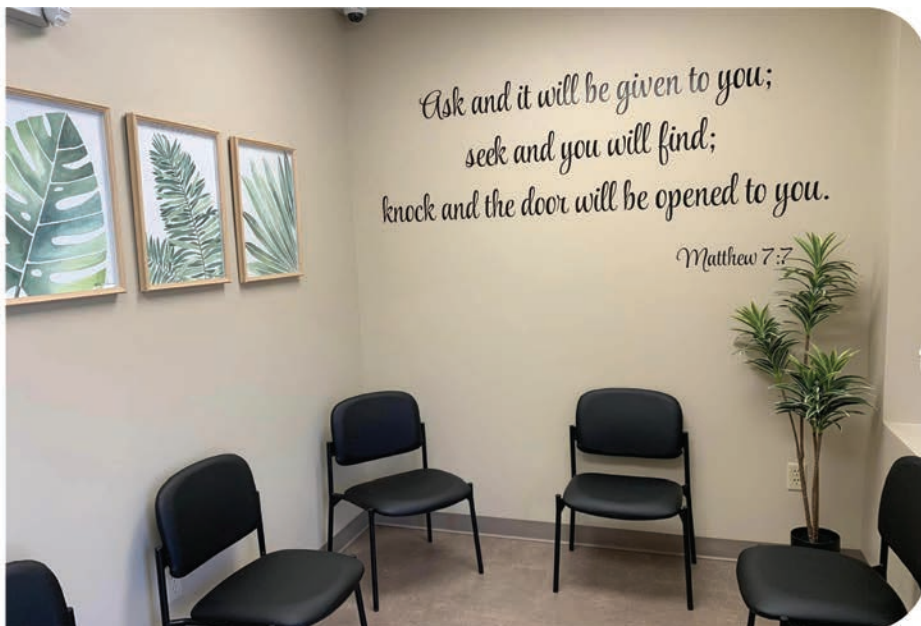
Emmaus Clinic waiting room – All are welcome