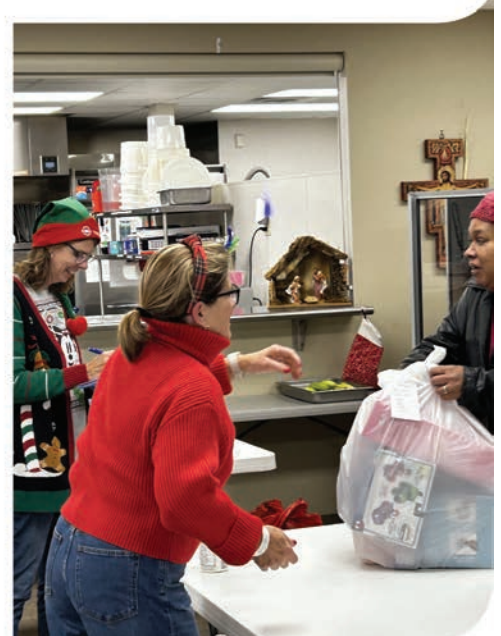
Bringing joy to others at Christmas