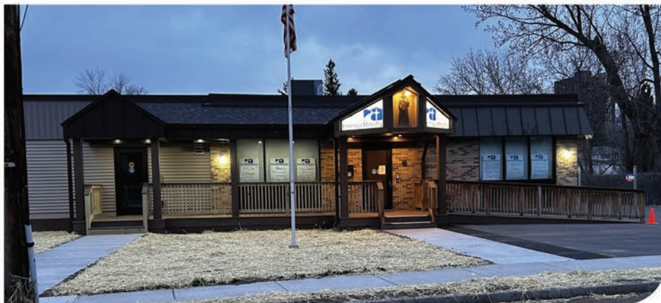
Early morning at Emmaus, April 2024