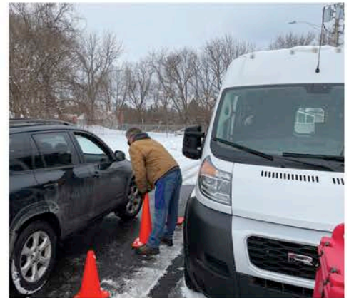
Getting to know our guests