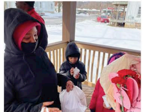
Carnations for everyone.