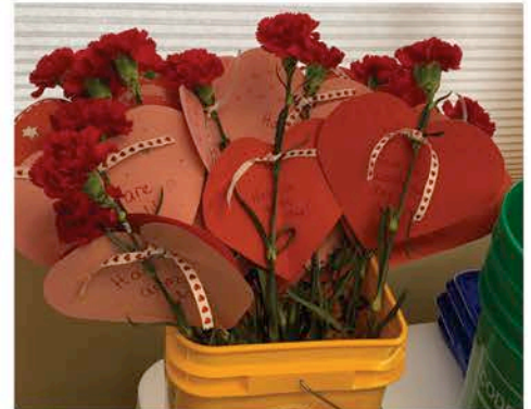
St. Agnes Florists

The event raised over $2,200 for Emmaus as nearly 50 of you provided a loving contribution. Special thanks to Saint Agnes Florist on South Avenue for donating half of the flowers and providing a generous discount on the cost of the remaining carnations.