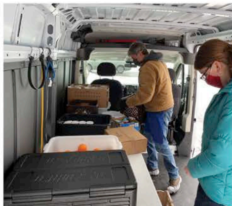
Setting up for distribtuion

many people as we can. With your support, we look to expand our mobile meal offerings to other neighborhoods soon. Opportunities to sponsor this and other ministries are available on page 8.