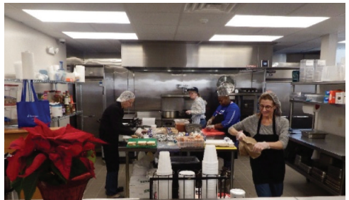
New LARGER kitchen with separate cleaning area