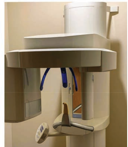
Donated Panoramic X-ray machine