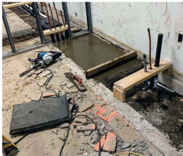
Trench work for dental suites